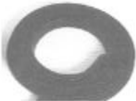
FITS MOST GM CARS